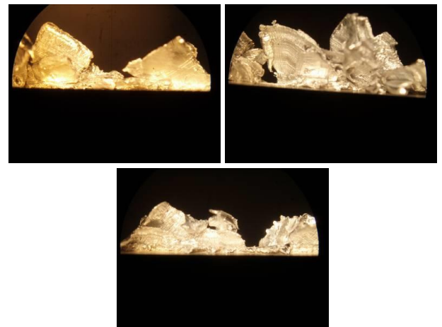
Figure 6. Images for test 15