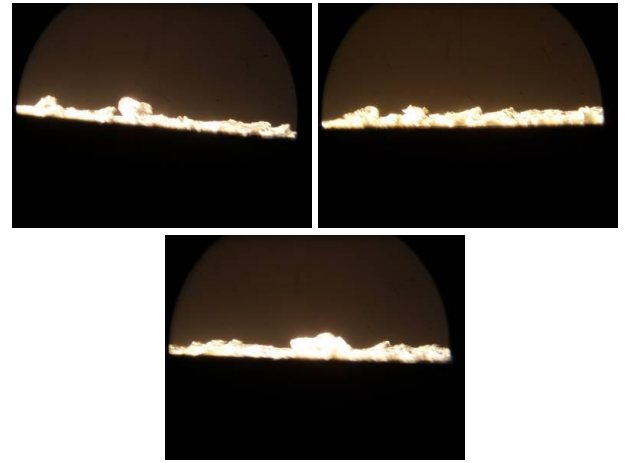
Figure 5. Images for test 6