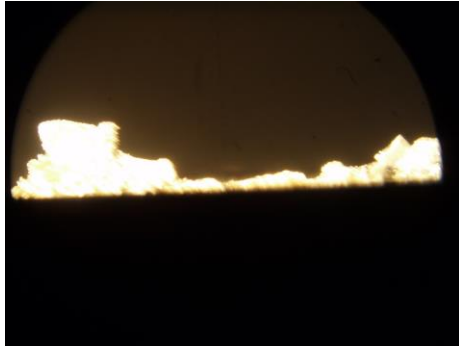
Figure 3. Sample image [7]

The captured image is transformed into grayscale format for further analysis. To calibrate the system, burr height measurement is firstly performed using the dial gauge along the cross-hair reference of the microscope and the same is then done manually on the image to get the relationship in micrometers per pixel. Based on this, the resolution of the system was determined to be approximately 2.2 \mu\text{m} . Next the edge of the work-piece is automatically determined and used as a reference for making the measurements. The developed vision system also caters for the disorientation of this reference line during image capture. That is, it determines the inclination of the reference line and aligns it to the horizontal axis before taking measurements