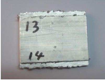
Figure 2. Sample work-piece [7]

A sample end-milled work-piece for burr height measurement is shown in Fig. 2 and a sample captured image is shown in Fig. 3.